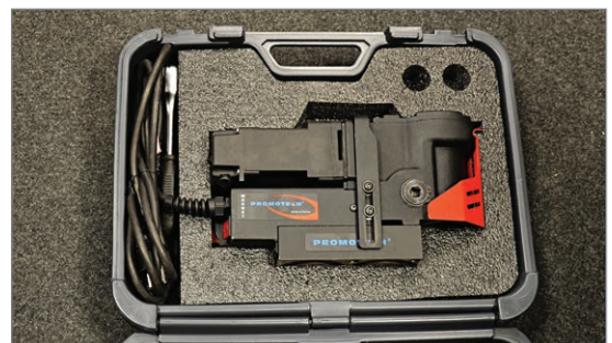
Handy plastic case