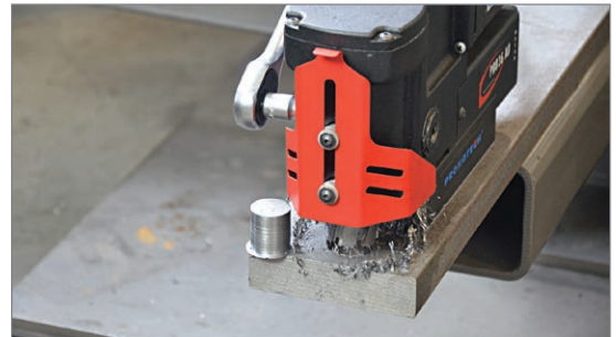
Max milling capacity up to 36 mm (1-7/16").