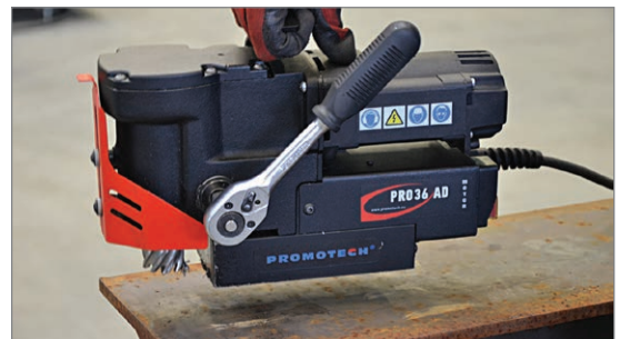
Lifting handle for easy transportation.