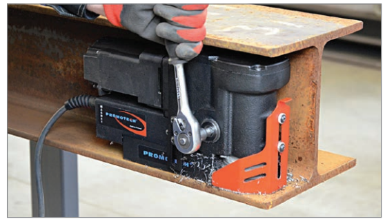
Compact design for height restricted areas. Detachable feed lever (feat. ratchet) can be fixed from either side.