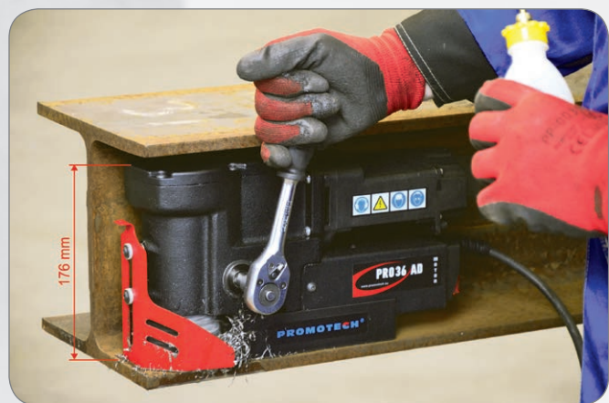
PRO-36 AD fits in the tightest spots