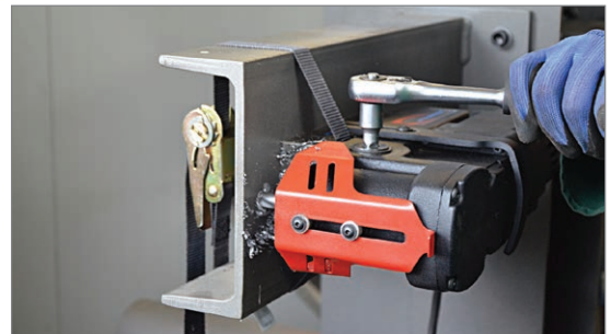
Working in out of positions.